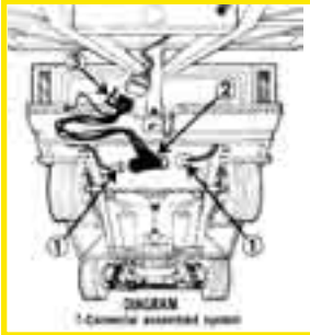
Diagram shows how the "T" connector works on trucks that have a plug-in taillight connection... usually located just behind the rear bumper.

For Connecting: • Camping Trailers • Boat Trailers • Horse or Stock Trailers or any trailer!